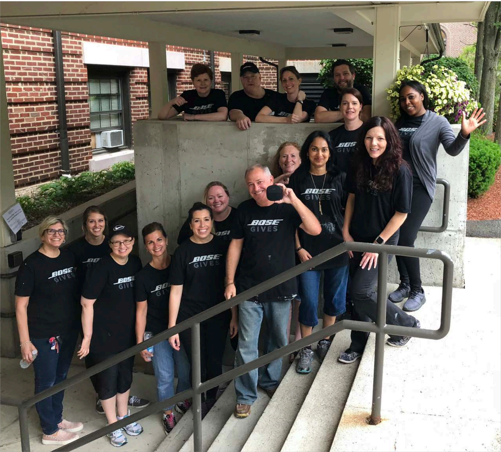
This volunteer crew of BOSE employees did an incredible job painting our ground floor space in June!